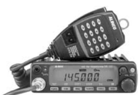
DR-135TP 2M mobile