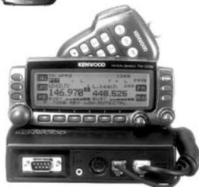
TM-D700A 2M//440 Dualband