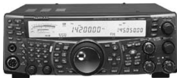
TS-2000 HF/VHF/UHF TCVR