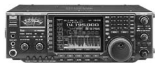
IC-756 PRO III All mode Transceiver